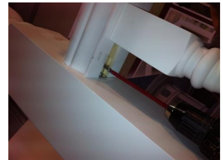
24. Fasten both ends of the top rail brackets with the supplied screws.