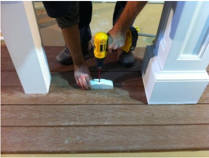
19. Fasten the support block with a screw. Make sure it is centered between each posts, or wall and post.