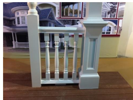
26. Repeat steps 1 to 25 for each rail.

If you have questions regarding these installation instructions, please contact your Plastika sales representative or our customer service at 1-888-846-4419.