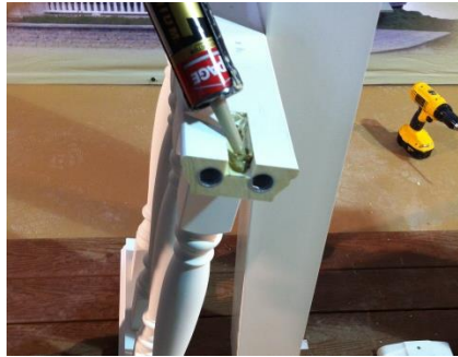
20. Apply a ½" bead of a urethane based construction adhesive to the underside of each end of the top and bottom rail, where the angle brackets will meet.