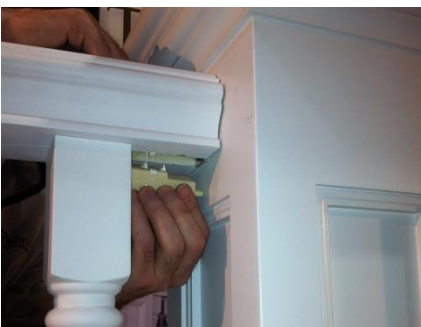
25. Install plugs to each end of the top and bottom rail.