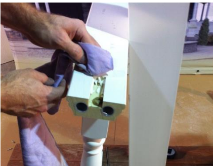
22. Clean off any excess glue and silicone caulking.