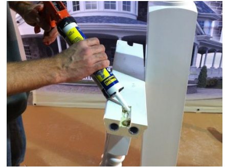
21. Apply a line of silicone caulking to the underside of each end of the top and bottom rail, where the plugs will be installed.