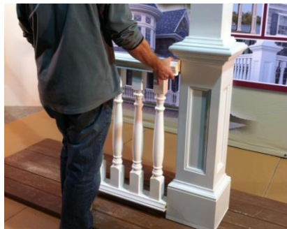
23. Position the rail in place